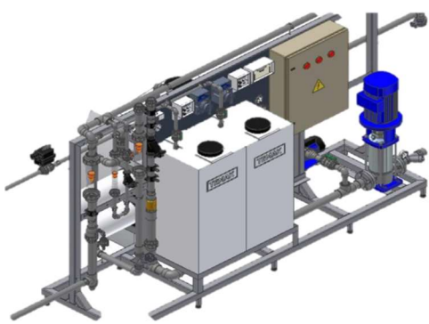
Reverse Osmosis Desalination plant

The project consists of 150 standard rooms and 12 villas, including all auxiliary buildings like reception, conference center, restaurant and back of house. The project also consists of the design of a desalination system and sewerage treatment plant. The hotel is aiming for a 5* hotel.