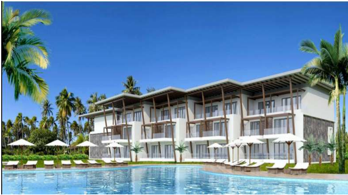
PROPOSED 5 STAR HOTEL AT BEL OMBRE

Medium Voltage installation, Transformer sizing, Distribution panel sizing, Lighting, LV Power, Telephone System, Internet Access, Sizing of PV, Fire Alarm, TV, Generator and cable sizing on Electrical Services.