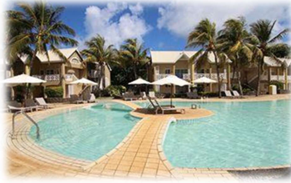
CALODYNE SUR MER